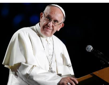
Message of Pope Francis to the XVI Congress of Alumni of Jesuit Schools in Latin America Guayaquil, Ecuador 11 th November 2015